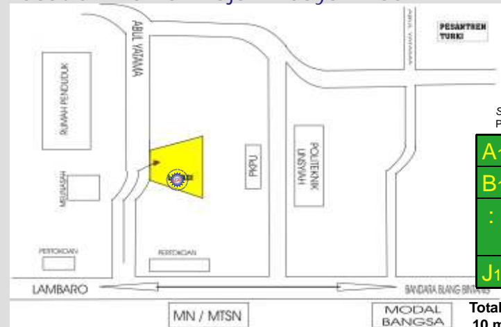
SKEMA WAKAF KAVLING PADA LAHAN 10.000 M2